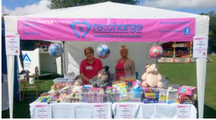
Hurley Regatta - last year!

R&R are running a Prize-every-time Tombola at Hurley Regatta. This is a great event for all the family with many sideshows, rides, barbecue and other attractions, all in a lovely setting next to the Thames. Come and see us there, and have a wonderful day out!