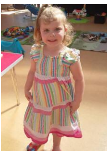
Lovely summer dress!

But we need to quickly find alternative accommodation, either office space or storage space or hopefully both combined. If you know of anything suitable, either free or for a cheap rent, please, please, get in touch.