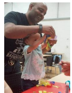
Dad enjoys play time

Huge R&R thanks to these organisations, without whom we would be unable to continue.